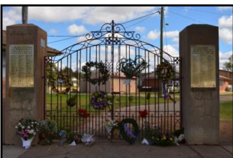
Cumnock Memorial Gates & Singapore Memorial, Kranji War Cemetery, Singapore.